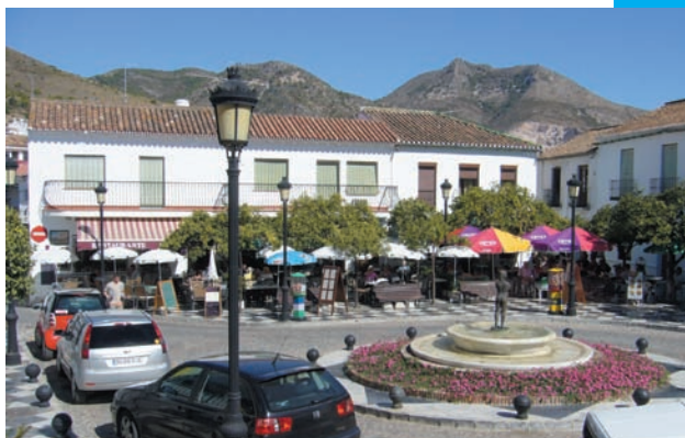
Benalmadena Village Square