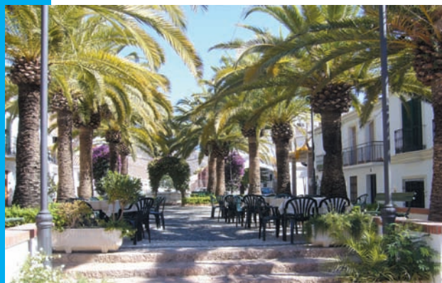
The picturesque streets of the pueblo.