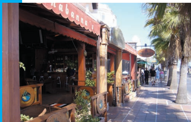
Bars and restaurants are plentiful on the costa.

There are many sandy beaches along the coast, in fact 14 of them are blue flag beaches including 'Benalnatura', Benalmadena's only official family naturist beach with a bar and restaurant.